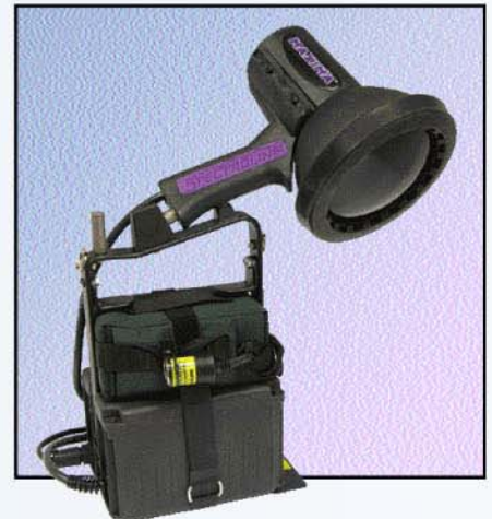
Battery-operated "M" version