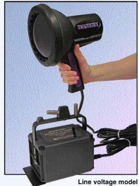
Line voltage model

All MAXIMA lamps are available in battery-operated versions — the ML-3500MS (spot), ML-3500MD (diffusing filter) and ML-3500MFL (flood). Each includes a 12-volt, 7 amp/hr rechargeable battery that will operate the lamp for two full hours. A battery recharger and carrying case are included.