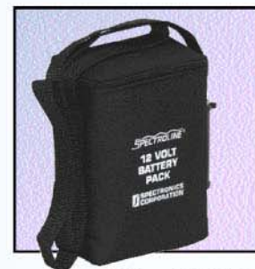
Optional BP-12A battery pack