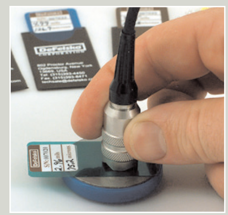
Steel and aluminum zero plates are available